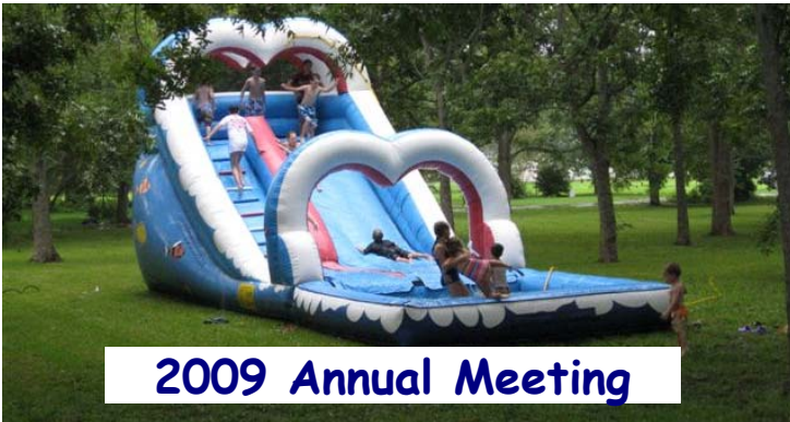
2009 Annual Meeting